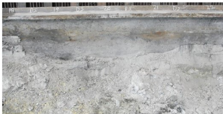
Figure 1. Highly reacted sidewall SiC bricks at lower cell life.

EGA has been using SiC bricks in the side wall lining since many years, while testing the bricks from various sources. In one of the tested materials, a noticeably higher degree of degradation of side wall SiC bricks was observed, which resulted in 30-40 % lower cell life in trial pots. Figure 1 shows a highly deteriorated sidewall SiC brick, even though the cell autopsy showed that the sidewall freeze protection against the chemical attack of molten electrolyte was adequate.