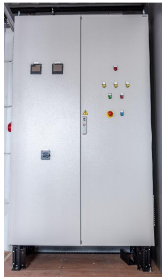
Figure 1. Electrical cabinet.

The electric cabinet was also designed and assembled with the fundamental elements, such as energy monitoring of plant and microwave, general switch, PLC and other ancillary elements (Figure 1).