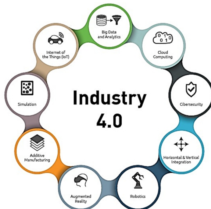
Figure 1. Industry 4.0 technologies [1].

The first three industrial revolutions are characterised as being driven by mechanical production relying on water and steam power, use of mass labour and electrical energy and the use of electronic, automated production respectively. Industry 4.0 refers to the ongoing phase of digitalization in the manufacturing sector, driven by data, advanced analytics, automation and advanced manufacturing technologies. It has a broader scope, which includes IIoT, digital transformation, and business sustainability.