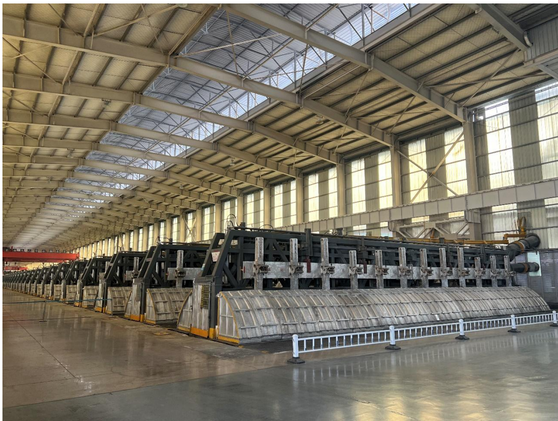
Figure 10. Retrofitted potroom (photo taken in May 2023).