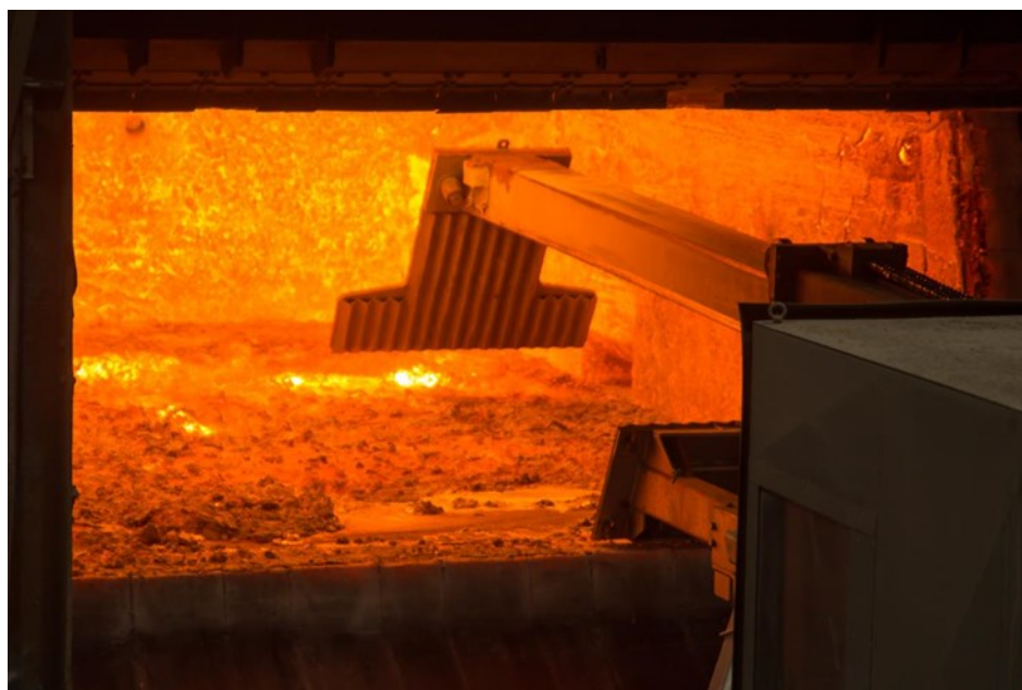
Figure 5. IFDP in melting furnace.

Using an RIA skimming machine increases the occupational safety in all modes of operation, because even in manual mode the operator is protected by an insulated operator cabin.