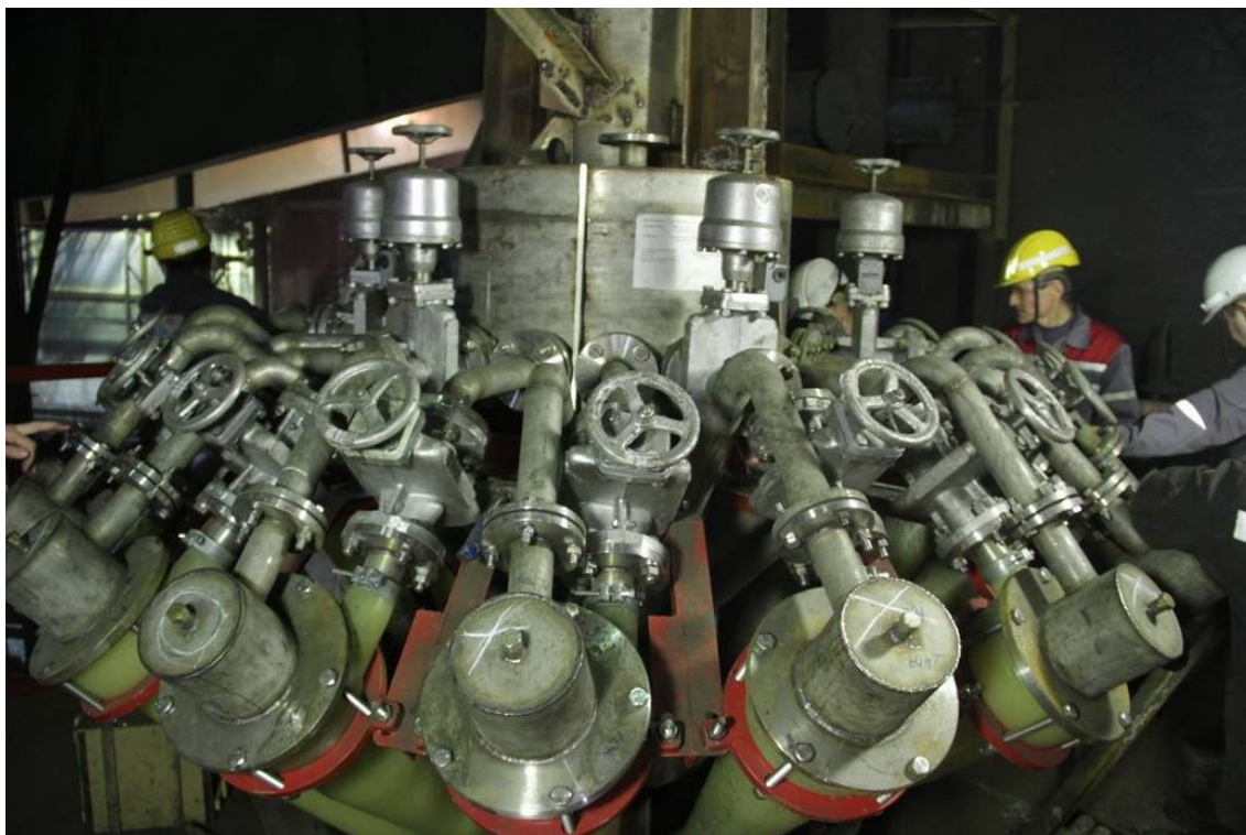
Figure 7. Multicyclone-thickener with automatic control system. PJC Western Branch MMC «Nornickel».

Industry as a whole (this is true for the alumina industry, too) is extremely conservative. It always prefers proved processes and takes great pains in resisting innovations which has not been tested many times. Meanwhile the experience of adapting and operating concentration apparatus at chemical enterprises and in hydrometallurgy [19] allows considering the feasibility of employing in technological processes washing, classifying, crushing and other equipment well proven in the course of operation for many years under various conditions.