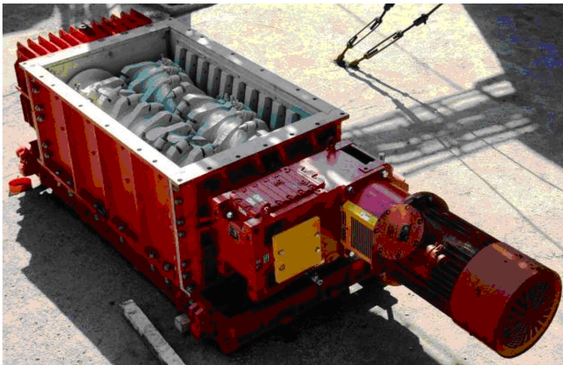
Figure 3. DShZ-500.20-75 (ДШЗ -500.20-75) double roll crusher with mining tooth.