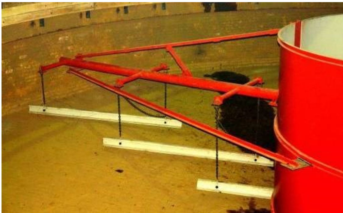
Figure 6. Mud removal system of rake type. AO «Olovokombinat». Novosibirsk.

The data of experimental studies and experience of industrial operation of hydrocyclones in AO «Aluminum of Kazakhstan», arrangement of multicyclones and experience of their operation with hydrostatic pressure of the pulp without additional sumps and pumps helped develop a new generation of these apparatus. In addition to classification diagrams of solid phase of different pulps by size or density today the hydrocyclones are successfully used to condition the pulps by solid phase content or to preliminarily thicken them in water turnover circuits. The property of fine classes of the solid phase of the hydrocyclone feeding pulp to distribute between sands and drain in proportion to the liquid phase content in them makes possible to use the hydrocyclone plants to desludge the clay-containing pulps.