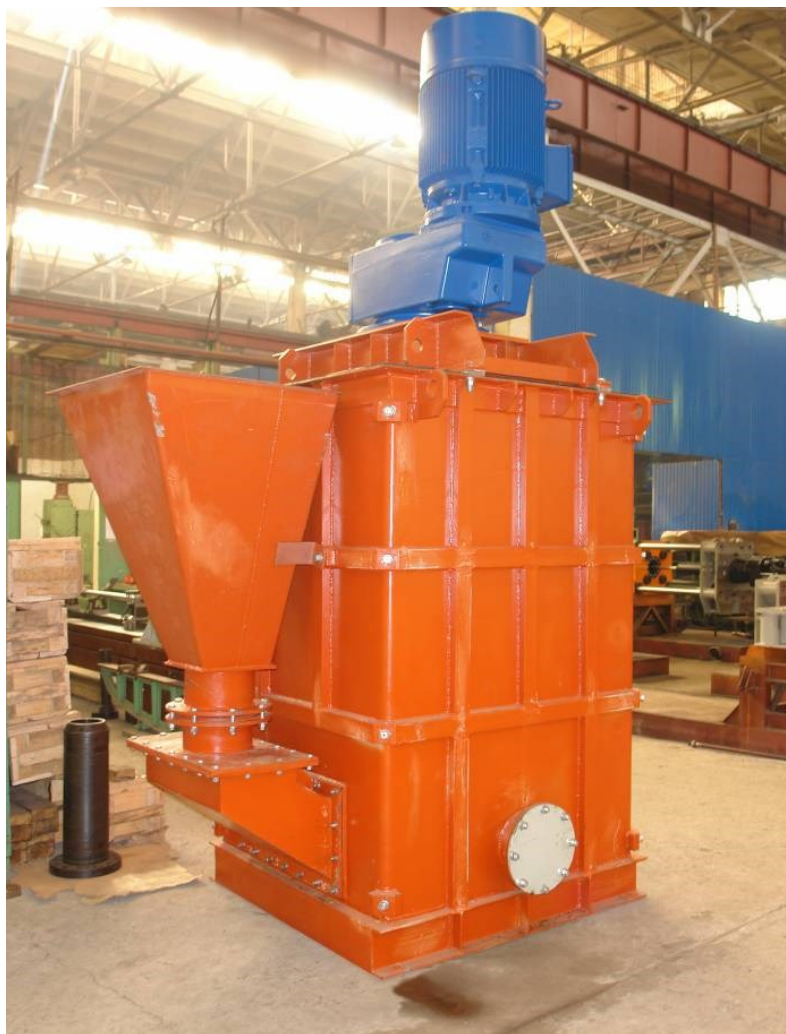
Figure 4. SOV-2 (COB-2) Attrition scrubber.

Because of high mixing intensity and high abrasiveness of the process the design of the machine employs special high quality lining materials. The apparatus can be used as suspension homogenizers, mechanical activators, conditioning tanks.