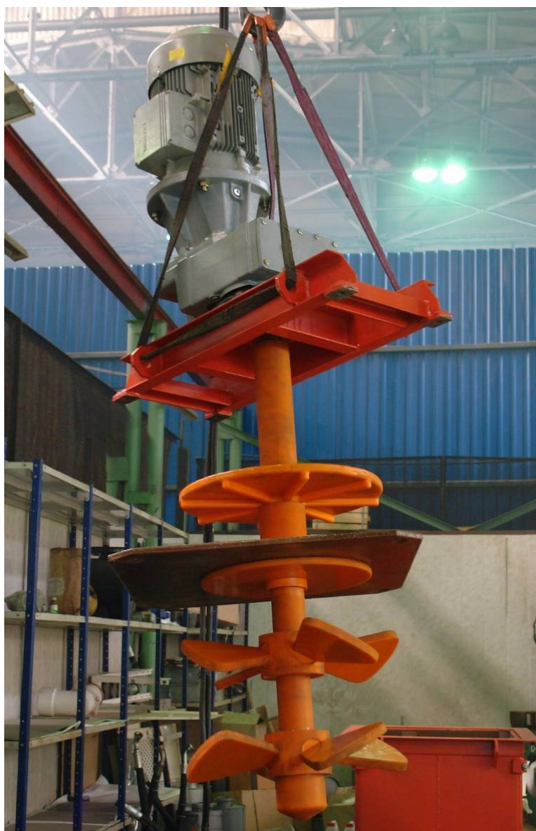
Figure 5. Impellers of mechanical activator.

determines stable operation of the entire plant. Removal from the process of forming clay agglomerates extracted by sizing trammel at the mills is a source of unaccounted loss of bauxite and alkali.