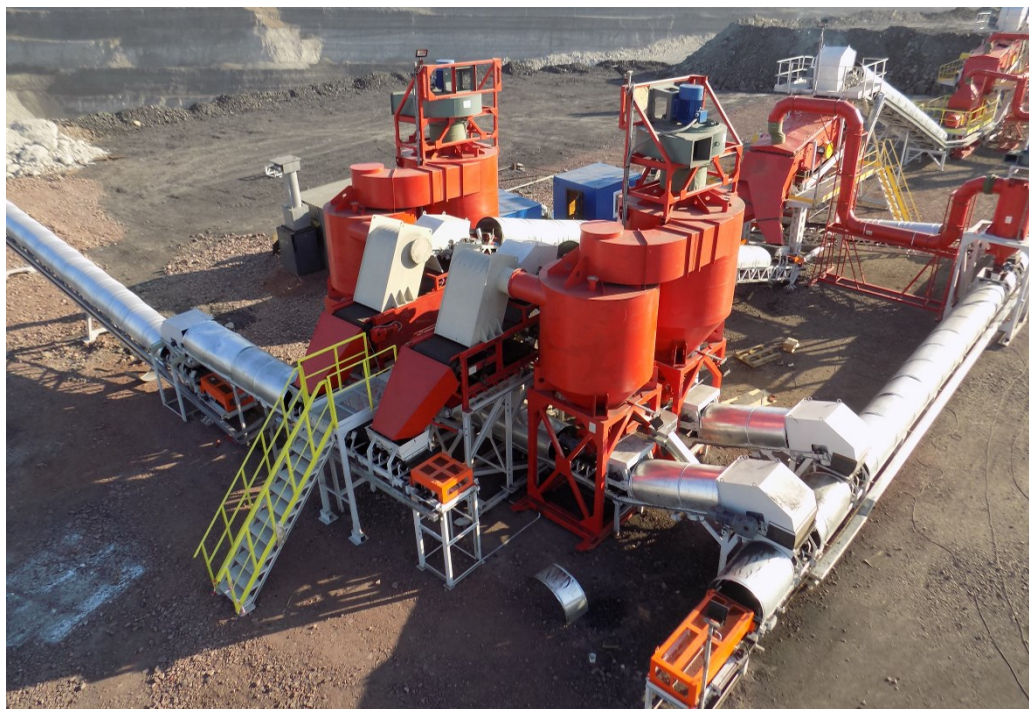
Figure 2. «SEPAIR» plant, «Molodezhny» surface mine, Kazakhstan.

Advantages of toothed screw crushers: smaller dimensions and weight as compared to other crusher types of analogous performance, e.g. jaw and cone crushers, low overgrinding, possibility of processing frozen and viscous-plastic products, maximum yield of products of prescribed size, compactness, simple design, quick replacement of operating tools, possibility of working under rubble, Figure 3.