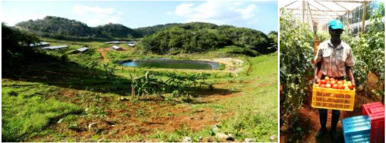
Figure 3. Greenhouse farming in Watt Town, St. Ann Jamaica

Apart from all these initiatives mentioned, each bauxite company has its own projects with respect to corporate social responsibility. These include the setting up of micro-enterprise business development programs, providing a supply of potable water in areas where the National Water Commission service is inadequate, and scholarships at secondary and tertiary education levels.