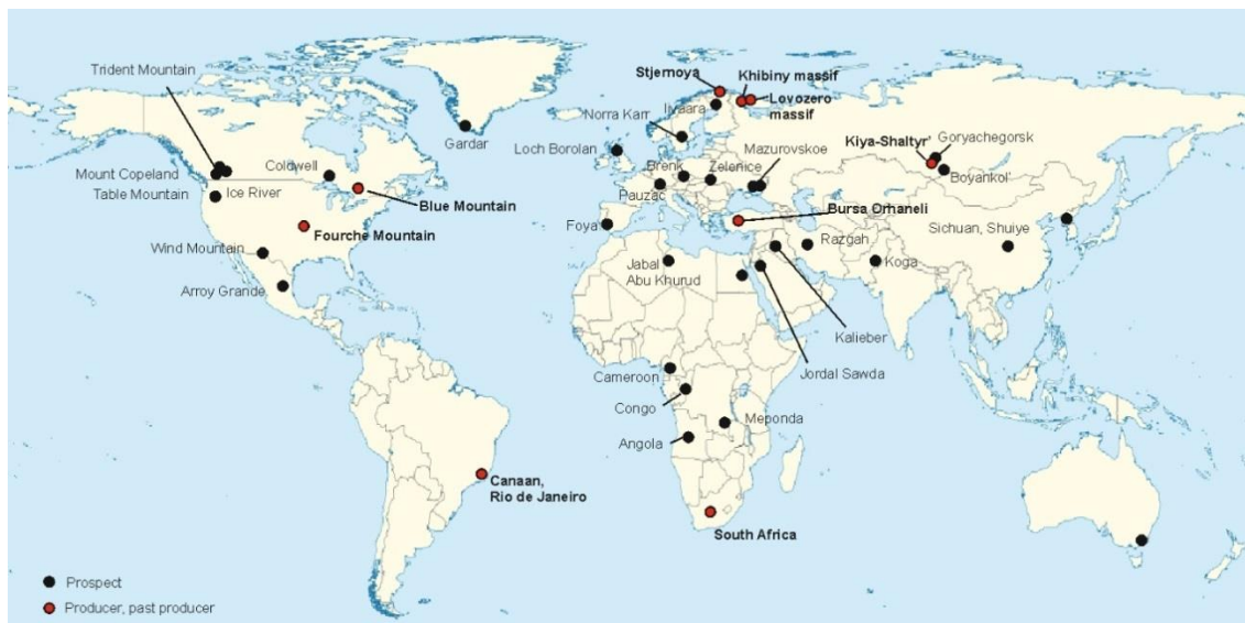
Figure 1. Nepheline mines and deposits of the world (adapted from [1]).

Nepheline syenites are widely distributed in Russia (Kola peninsula and Siberia), Canada (Ontario, British Columbia), USA (Arkansas, New Jersey / Beemerville, Massachusetts, Texas), South Greenland, Mexico, Norway (Northern Norway, Oslo district), Sweden, Finland, Italy, Germany (Dresden district), Czech Republic, the Ukraine, Kazakhstan (Priishimye), China, Iran (Razgah deposit), Pakistan, India, South Africa (Kenya, Uganda etc.), Madagascar, Chile, Bulgaria, Brazil, etc.. The mines and deposits of nepheline ores are shown at Figure 1.