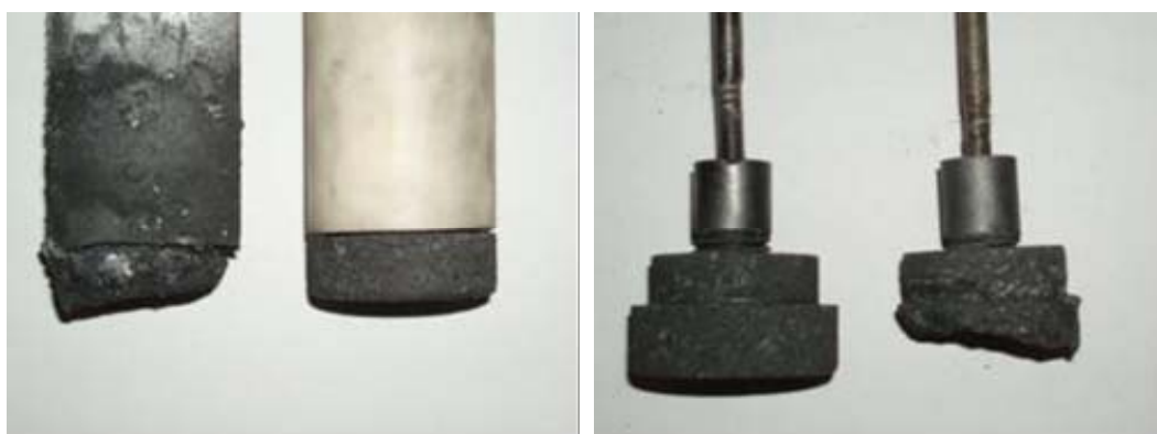
Figure 7. Uneven anode consumption caused by carbon dust trapped underneath the anode after experiments with 8 wt.% C addition, compared with a new anode.

Accumulation of carbon dust underneath the anode may set up a concentration gradient in the vicinity of the anode with respect to dissolved alumina, and eventually initiate an anode effect. This kind of anode effect was very hard “to kill”, and this was the reason for finishing some experiments earlier than after 6 hours.