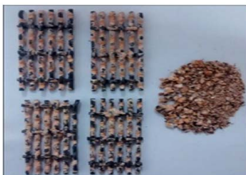
Figure 18. Aspects of the conditions of the sample after caustic cleaning wire mesh 15 hours with the total amount of crust removed.

The laboratory apparatus does not reproduce in full the cleaning conditions of the area by the absence of flow. Tests showed that a large part of the crust was dissolved. After cleaning, a simple manual manipulation caused the crust gives off the screens. If there was the possibility to reproduce in the laboratory an incidence of flow possibly this crust on the screens would be removed almost entirely. Soda will be lost if the solution temperature is below 75 °C because the formation of compound C_4ACO_2H_{11} reducing the efficiency of the solution. This phenomenon did not occur during cleaning due to strict control of temperature by 90 °C.